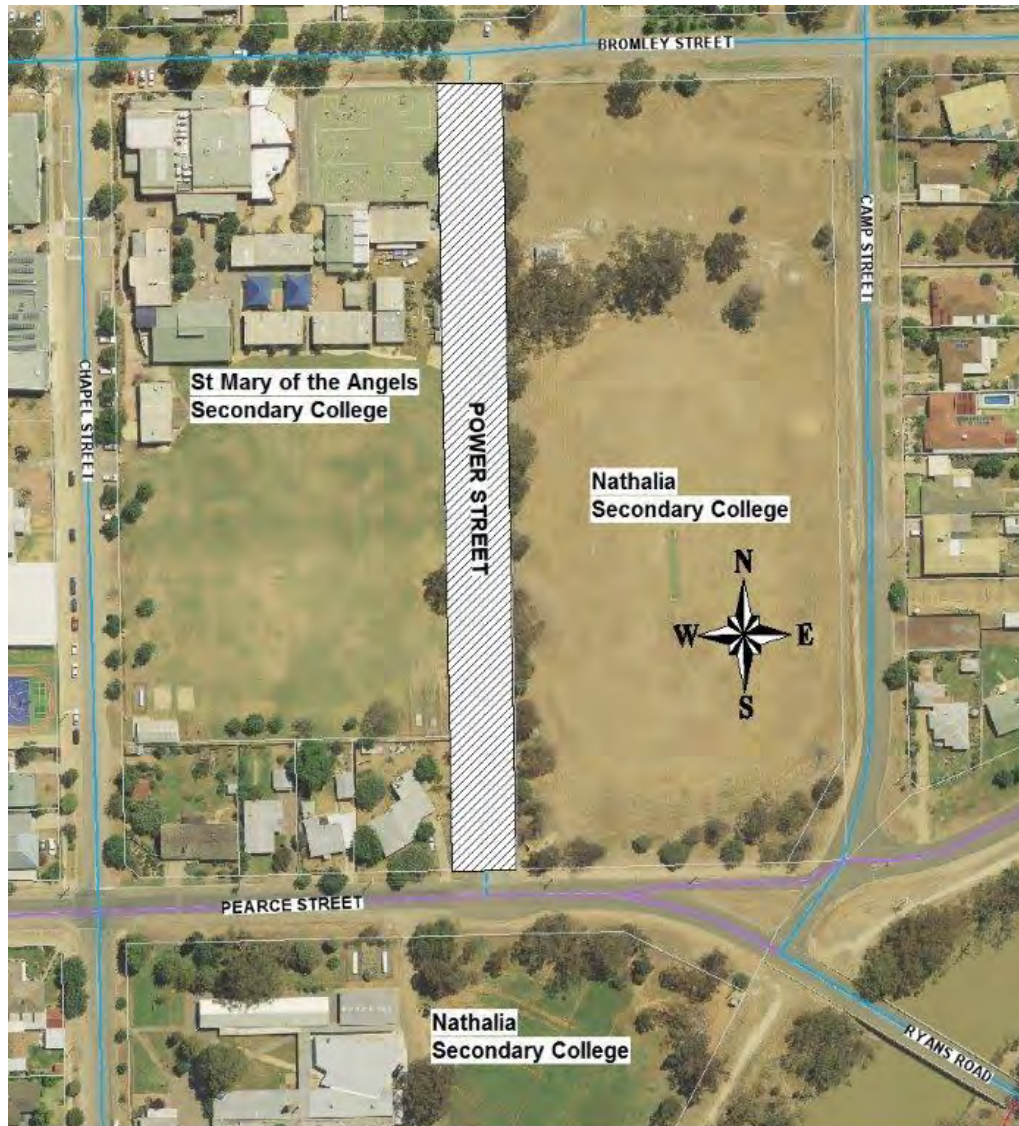
Figure showing location of Power Street with respect to St Mary's of the Angels College.

ITEM NO: 9.2.2 (MANAGER CONSTRUCTION AND ASSETS, GRAHAM HENDERSON) (GENERAL MANAGER INFRASTRUCTURE, ANDREW CLOSE)