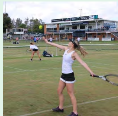
Country Week Tennis