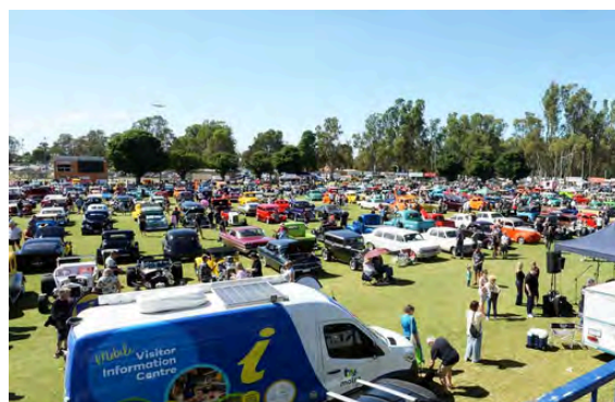
Annual Rod Run