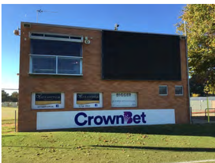
Asset: Oval scoreboard & timekeepers box