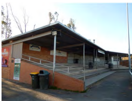
Asset: Oval grandstand