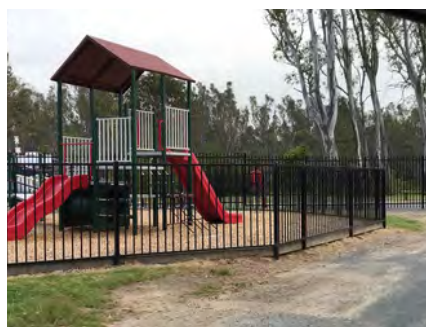
Asset: Playground fencing

Recommendation: Continue to maintain Install shade sails in the future upgrade