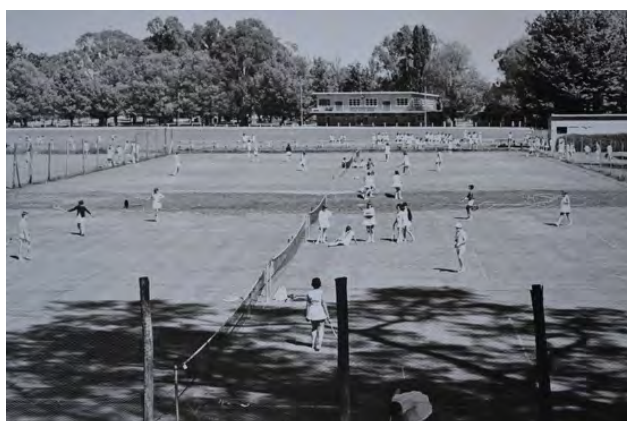
Saturday morning tennis at the "Grove" 1960's