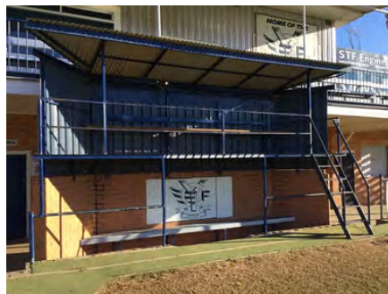
Asset: Oval interchange boxes