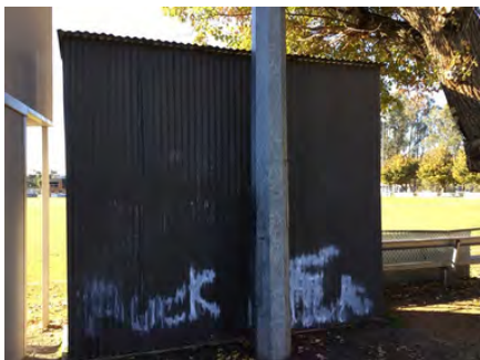
Asset: Oval timekeepers box