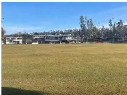
Asset: JC Lowe Oval

Recommendation: Consider replacement in new location as a long term project