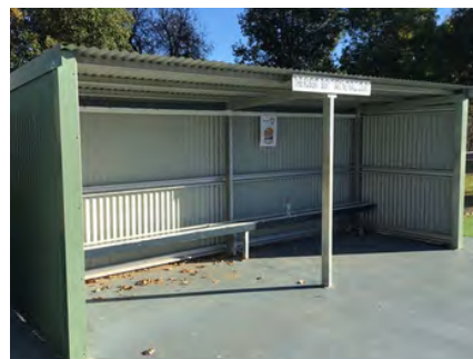
Asset: Netball shelters