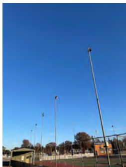
Asset: Tennis court lighting