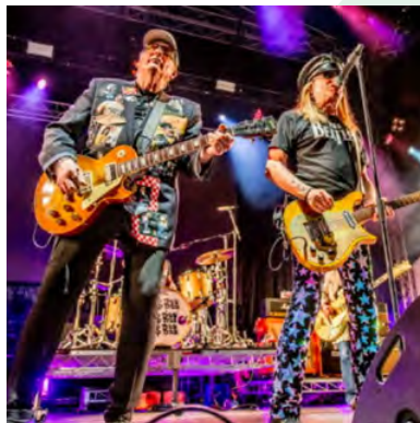
Under The Southern Stars