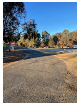
Asset: Swimming pool car park