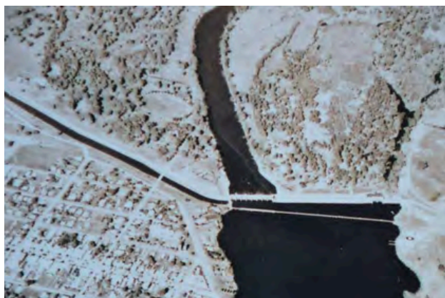
Aerial photo taken in the 1940's