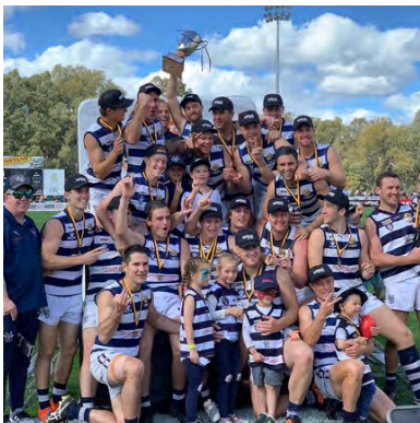
Yarrowonga Football Netball Club

Female change facilities at the football netball venue were completed in recent years and provide high quality facilities for users. The football facilities have been continually refurbished over a number of years including the removal of walls. The end product although aged, is currently meeting the needs of the existing clubs.