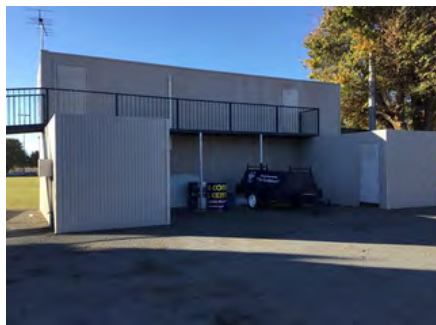
Asset: Oval coaches boxes

Recommendation: Continue to maintain as required