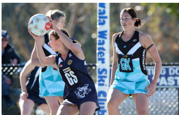
Yarrawonga Football Netball Club