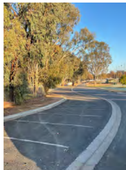
Asset: Entrance car parking

Recommendation: No maintenance required Redevelopment to consider pedestrian traffic and lighting into the future