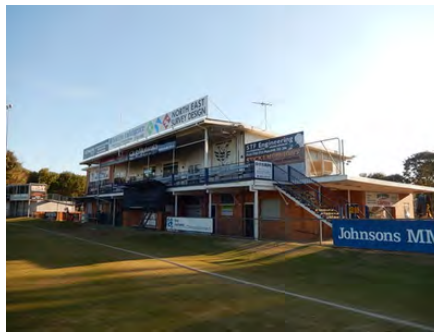
Asset: Dempsey Pavilion