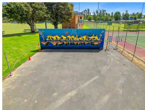
Hit Up Wall