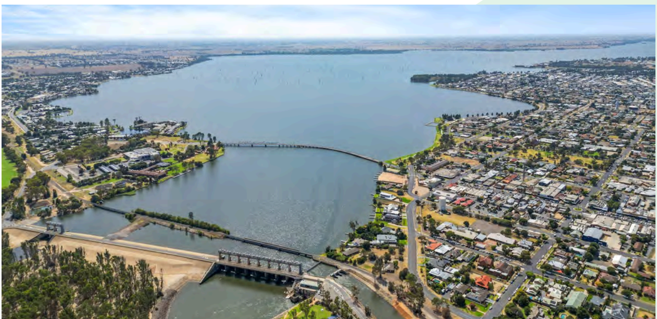
Yarrawonga - Mulwala