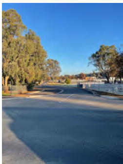
Asset: Entrance road