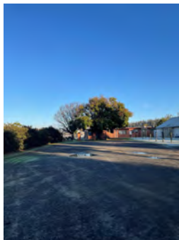
Asset: Tennis clubhouse carpark

Recommendation: Resurface and formalise car parking spaces to maximise space