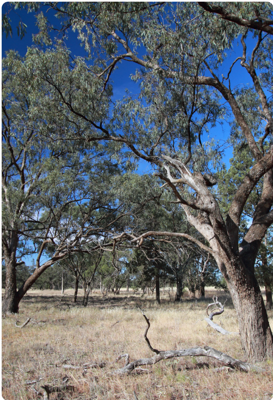
A small scattering of fallen timber can make all the difference to the health of your property.