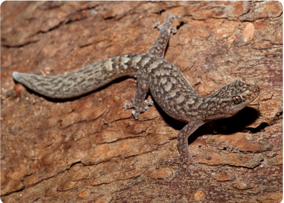
Marbled geckos rely on the safety and food provided by the ground storey.

Everything this little reptile will ever need is here. Beneath the ground storey the soil is damper, meaning a wider menu selection for the marbled gecko, and where there are safe places for a nest of tiny gecko eggs.