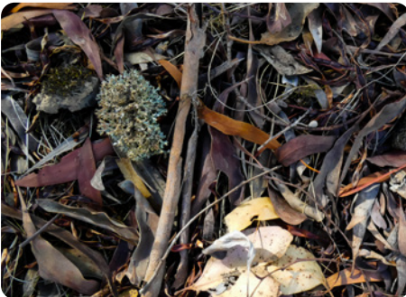
Soil nutrient in the making.

The role of bacteria: Fallen logs, soil, moss, lichen, fragments of insects, leaves, and roots, are also home to the tiniest of decomposers: bacteria. Bacteria is important because it can immobilize the nitrogen present in the soil, keeping it from being lost to the air and water. Bacteria confines nitrogen to the root zone to nourish growing plants and trees. Bacteria can also act as a disease suppressor, break down acids in the soil to release nutrients, help aerate the soil and accelerate creation of topsoil and humus.