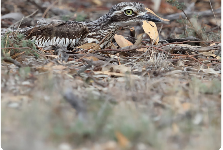
Main photo: Bush-stone curlew. Insert: Bush-stone curlew chicks. These birds are highly reliant upon the ground storey.