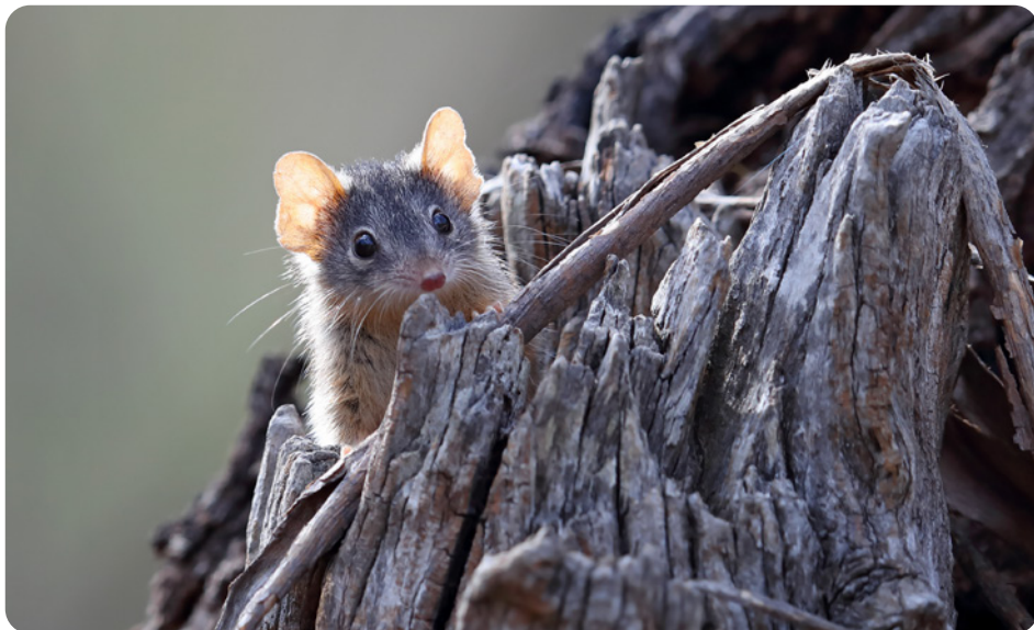
The yellow-footed antechinus is a carnivorous marsupial that relies on the ground storey in which to hide when foraging for food in the wide, dangerous world.