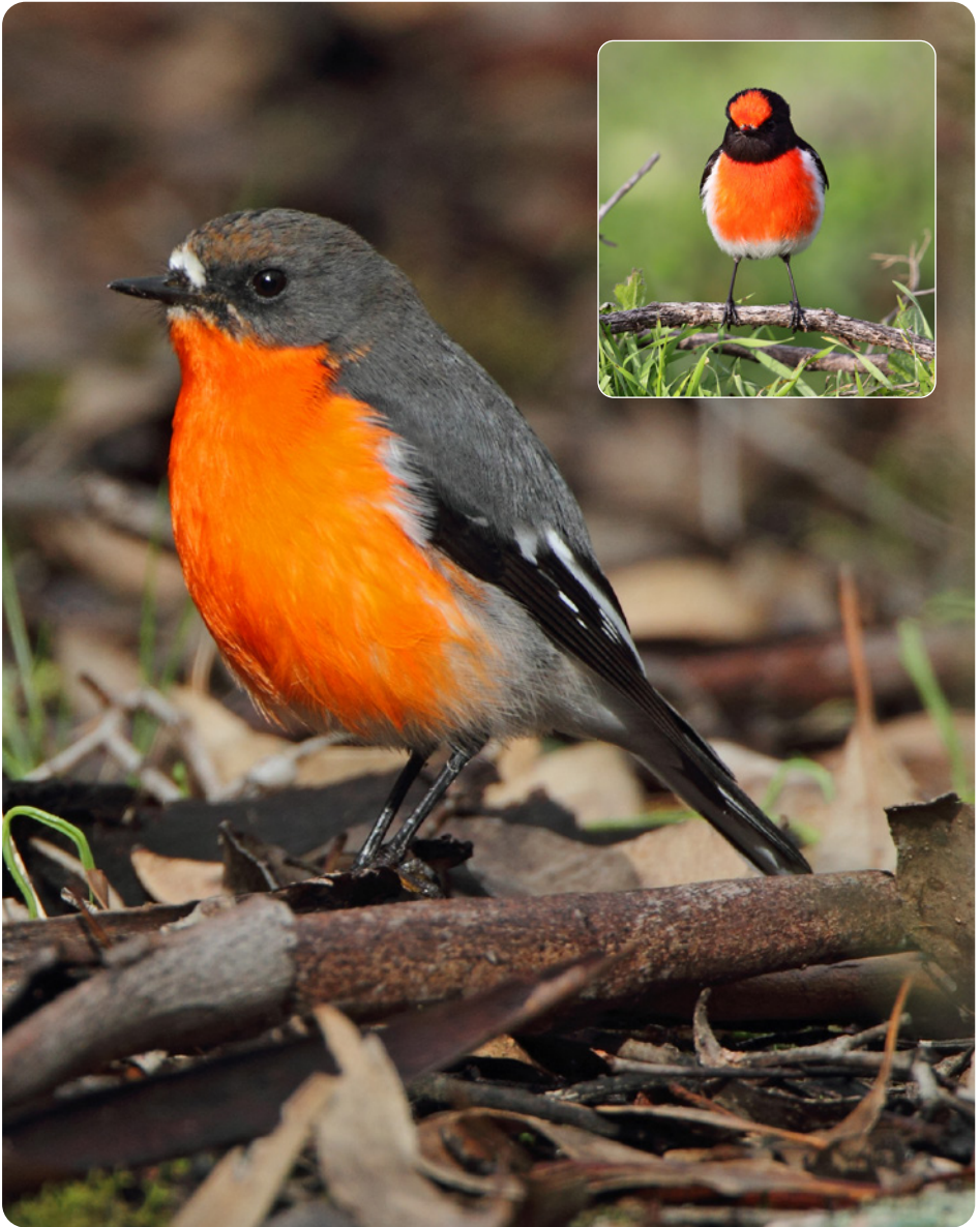
Main photo: Flame robin. Insert: Red-capped robin.