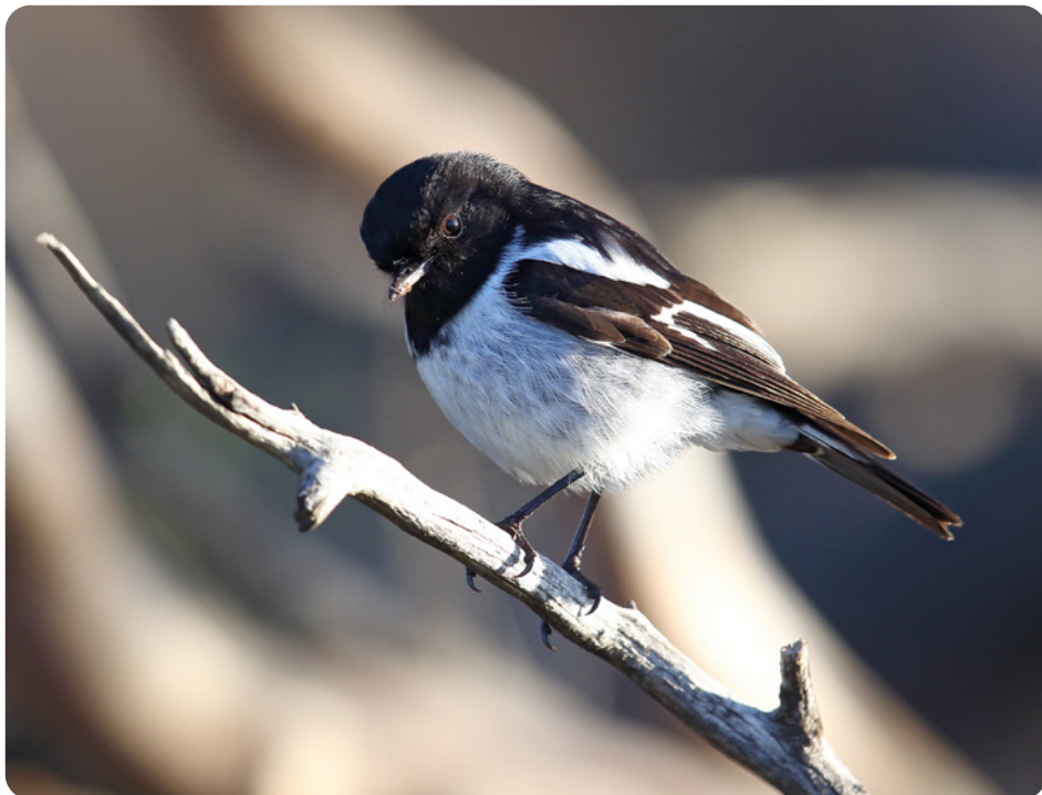
Hooded robins need small branches close to the ground from which to 'perch and pounce'.