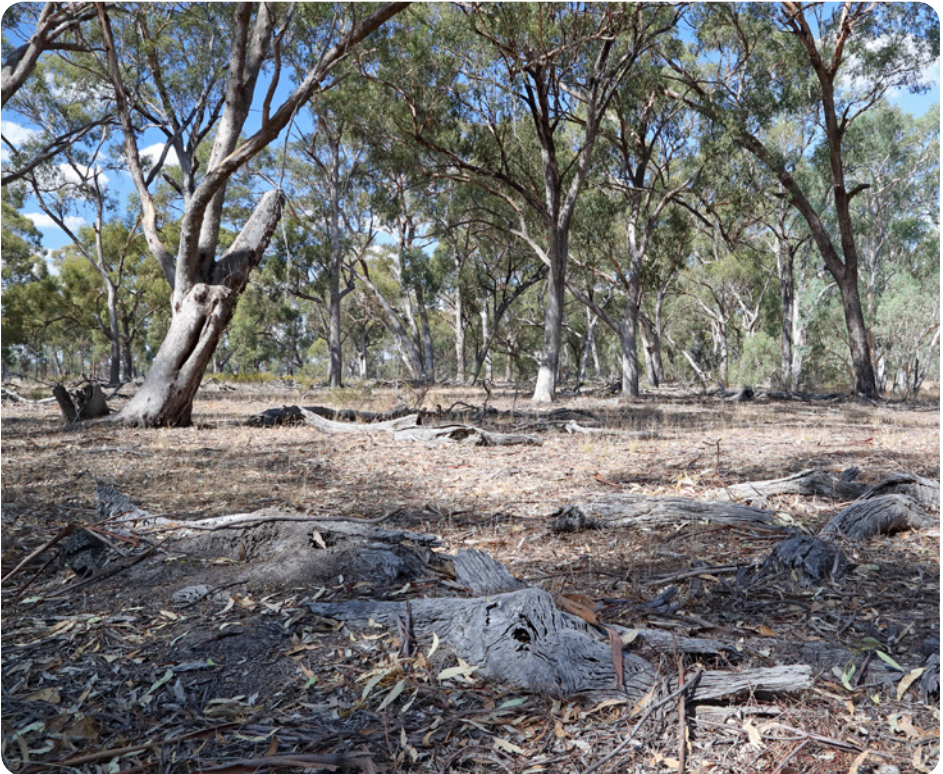
A healthy, intact ground layer scattered with fallen timber protects the soil from the destructive effects of erosion.

Part of the overall picture: Naturally, not all erosion can be wholly apportioned to a lack of fallen logs and the organic ground layer – that would be too simple! However, the ground storey contributes to the overall health, resilience, and stability of your property helping to protect against the devastating impacts of erosion, which is always expensive - and often impossible - to restrict or fully repair.