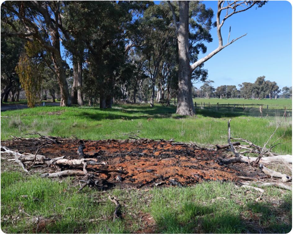
Ground that is bared by burning the ground layer and fallen timber is an open invitation to weed invasion.