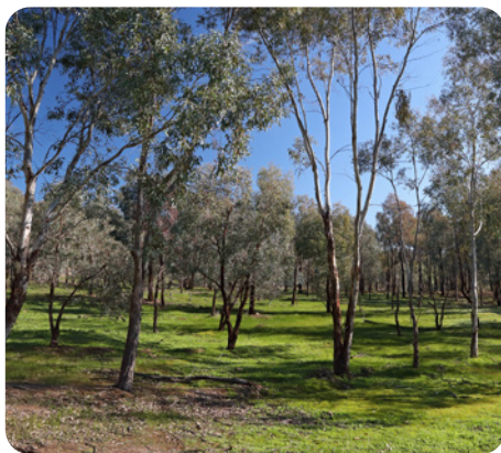
A small purpose-planted firewood lot can provide a constant supply of fuel, save you time, add to your property's value and save habitat.