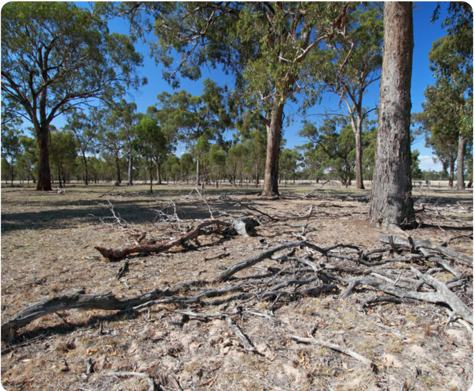
Although lacking in understorey plants and shrubs and showing the effects of 'pugging' by livestock, this site is used as a roosting site by bush-stone curlews. The presence of some fallen timber is all that is needed to make this site viable 'real estate and supermarkets' for this endangered species.

The ground storey is literally 'real estate and supermarkets' for our native fauna. By leaving the ground storey in situ, or by relocating it to a more suitable location on the property, where safe and possible, you are allowing for the natural processes on your property to unfold. You are giving a more diverse range of native species the opportunity to survive, feed and breed, and in return they will provide you with the all the enjoyment and satisfaction a healthy, functioning, and sustainable 'living' property with its varied layers of habitat can provide.