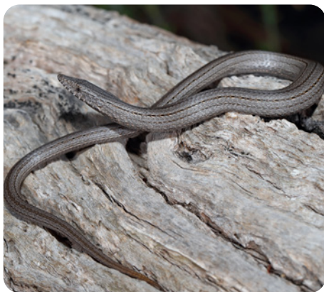
More than firewood. Faded and sun-dried, aged and weathered logs, with their cracks and crevices, offer the cryptic Burton's snake lizard camouflage and refuge.