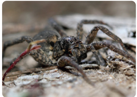
Without safe hiding spaces on the forest floor, the ground dwelling wolf spider will not survive.