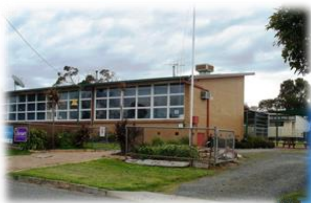
Tungamah Primary School