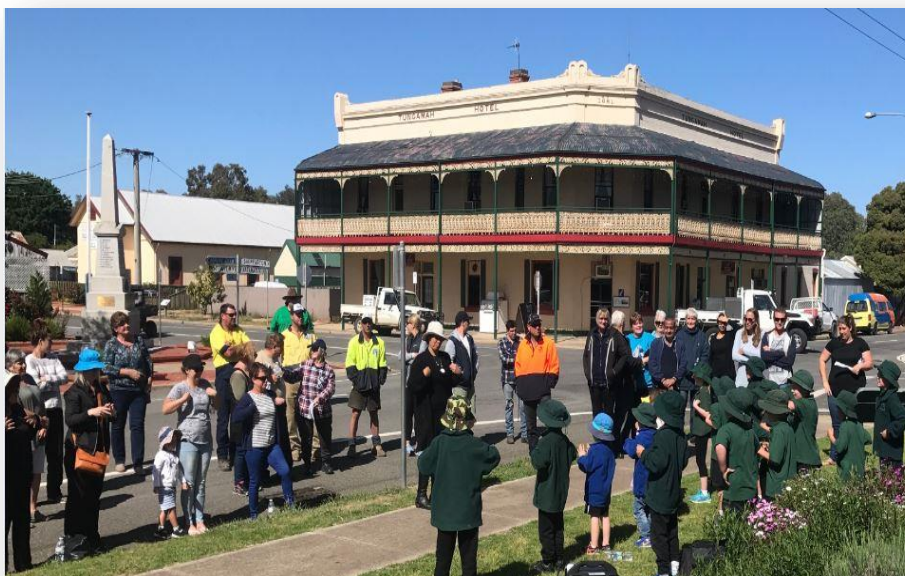
Community Planning BBQ