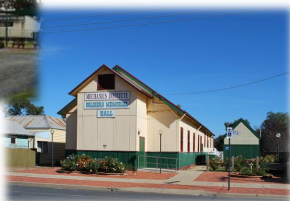
Mechanics Institute Memorial Soldiers Hall