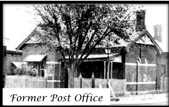
Former Post Office