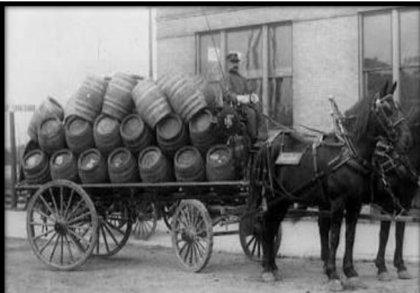
Wagon of beer, Tungamah - Boosey United Football Club won the 1886 premiership!