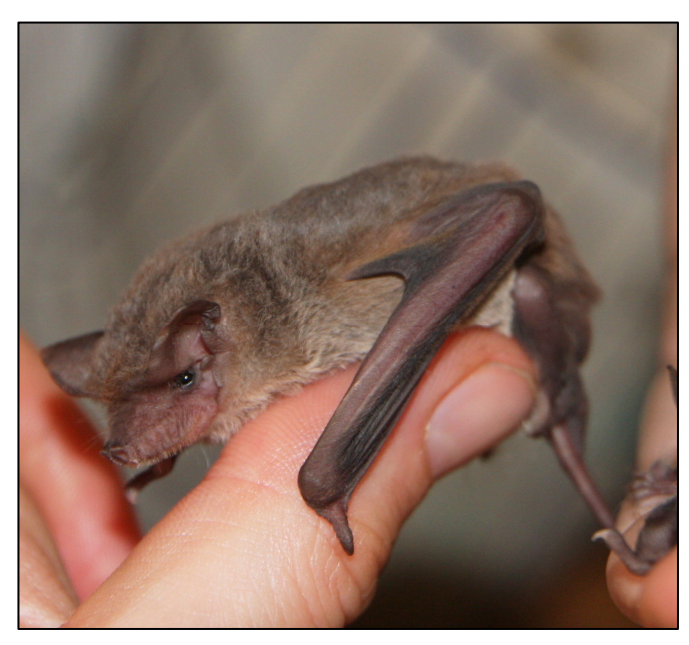
Figure 5: Mormopterus sp.