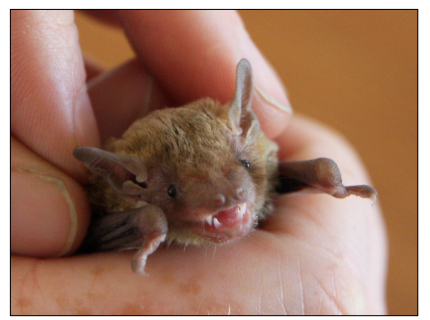
Figure 4: Scotorepans balstoni .