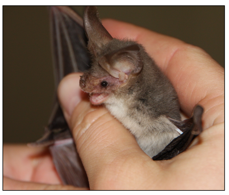
Figure 6: Nyctophilus gouldi .