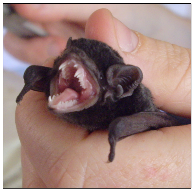
Figure 3: Chalinobus gouldii .