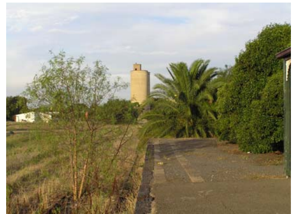
Figs 27&28. Views SSW (left ) and NNE (right) from the Cobram railway station along the historic railway reserve showing the view to the 1942 grain silos.

Note the railway tracks, platform, station buildings, and other infrastructure, such as the 'Westinghouse, McKenzie Holland Pty Ltd Melbourne' scales are intact.