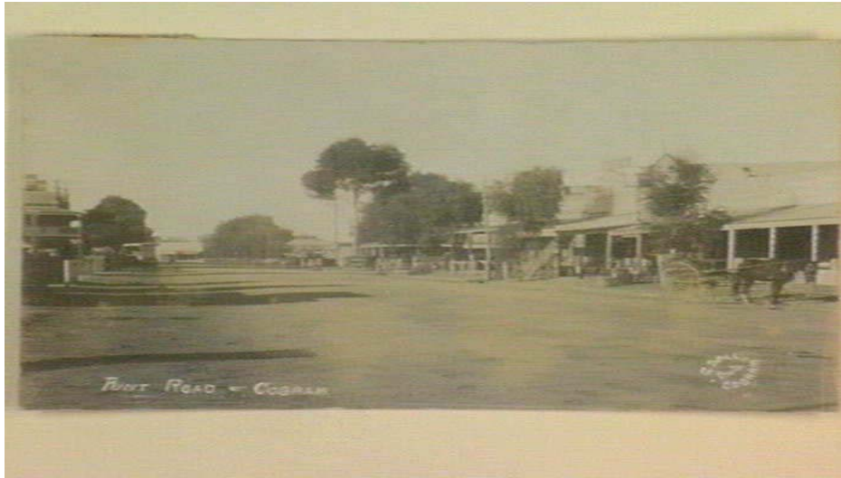
Fig. 21. A postcard c. 1910 showing Punt Rd. Note Grand Central Hotel on left and trees lining street.