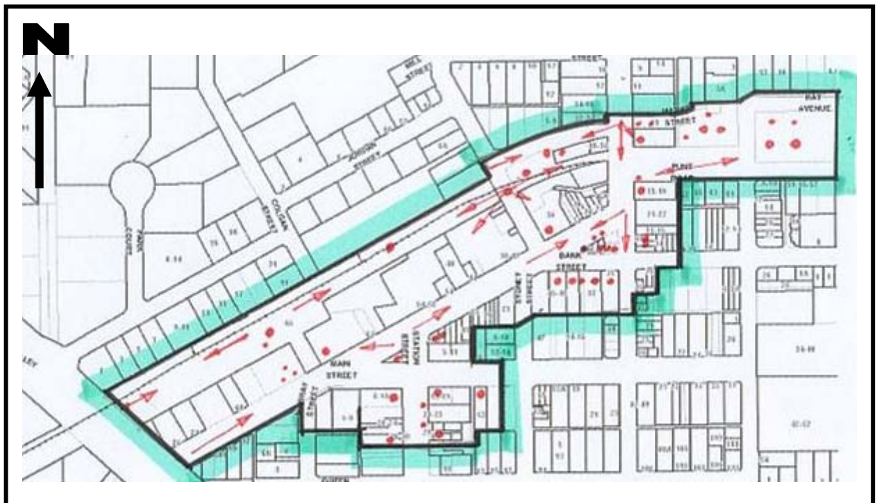
Fig. 2. Map of Cobram Town Centre precinct with location of 43 significant places marked with red dots and views with red arrows.

The Cobram Town Centre has two main view lines, one along Punt Road and the other along the railway line. The irregular boundary incorporates historically, socially, aesthetically and scientifically important buildings, views, and parks of Cobram's historic town centre. These are illustrated on the map in Fig 1 and listed in Table 1.