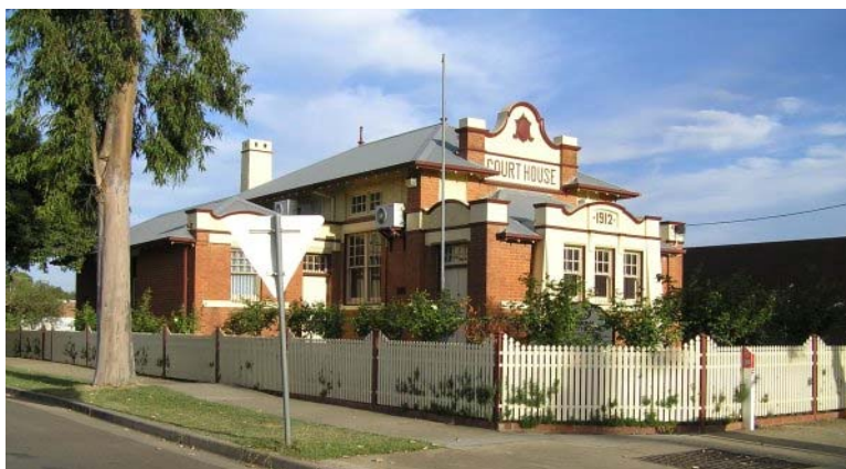
Fig. 17. Court House (1912) with adjacent tree.

Prior to the construction of the 1912 courthouse, Court of Petty Sessions hearings were held in the Mechanics' Institute hall. The site of the courthouse was the subject of long deliberation due to the Victorian Attorney-General's early determination to include a police station adjoining the court on a whole acre. The final quarter acre block was chosen upon the abandonment of this plan and the insistence by residents that the court be located at the town centre rather than at its edge as initially suggested. The land was purchased by the government from L. Gedye for £100. 8