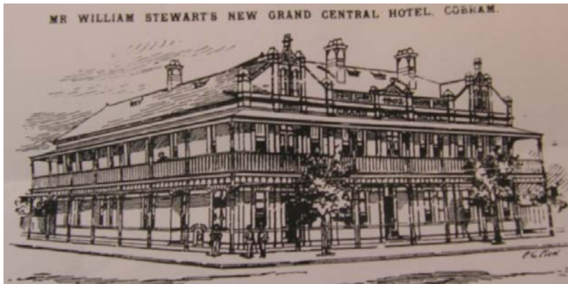
Fig. 42. Grand Central Hotel.

As can be seen in the contemporary sketch below, and comparing it with the photograph taken approximately 100 years later, the hotel is substantially intact. Alterations that have occurred are the loss of some of the timber verandah decoration and painting the brickwork. The original finish would have been unpainted red brickwork, which was fashionable in the Federation period.