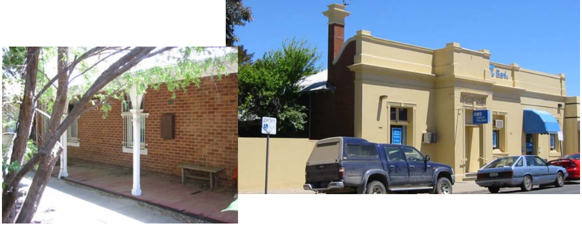
Figs 44&45. Side and front elevations.

The ANZ bank in Bank Street and the Office in Station Street are similar interpretations of the Federation Georgian style