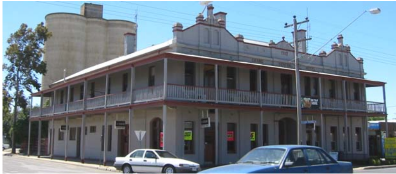
Fig. 41. 1902 Federation Free Style, Grand Central Hotel

As can be seen in the contemporary sketch below, and comparing it with the photograph taken approximately 100 years later, the hotel is substantially intact. Alterations that have occurred are the loss of some of the timber verandah decoration and painting the brickwork. The original finish would have been unpainted red brickwork, which was fashionable in the Federation period.