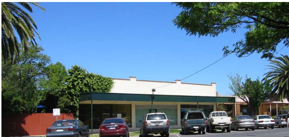
Fig. 51. Station Street shops.

All of the parapets of the Federation Free Style shops are intact except one, which could be reinstated to match the one on the nearest corner. However, the ground floor elevations appear to have been altered to various degrees. Leak Printing (far left in the photo above) may be the most intact. Removal of the blank board above the glass may reveal upper windows similar to those on the Beauty Centre adjacent. Furthermore, the posted verandahs have been replaced with cantilever verandahs. Reinstatement of the original design is possible using the available early photograph (see page 19).