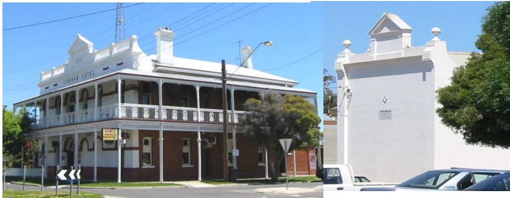
Figs 37-40. Cobram Hotel and Masonic Centre above, Cobram Railway Station building below .

The earliest building is the former Brown Corke and company store. Although the front façade is altered, the walls, roof and three dimensional design is mostly intact. The early photograph (Fig ) provides sufficient evidence for the reconstruction of the verandah, windows and door, on this substantial building, if desired. Less than four years later work commenced on the Cobram Hotel and it was completed by 1892. It was, and remains, one of the most substantial buildings in the precinct. It is designed in the Victorian Italianate Filigree style with cast iron verandah decoration contrasting with the cement rendered front elevation and red brickwork along the Main Street elevation, and balustraded parapet surmounted by a pediment similar to the one on Brown Corke and Co's store. A contemporary description of the building is on page nine which provides detailed descriptions of significant interior design and finishes.