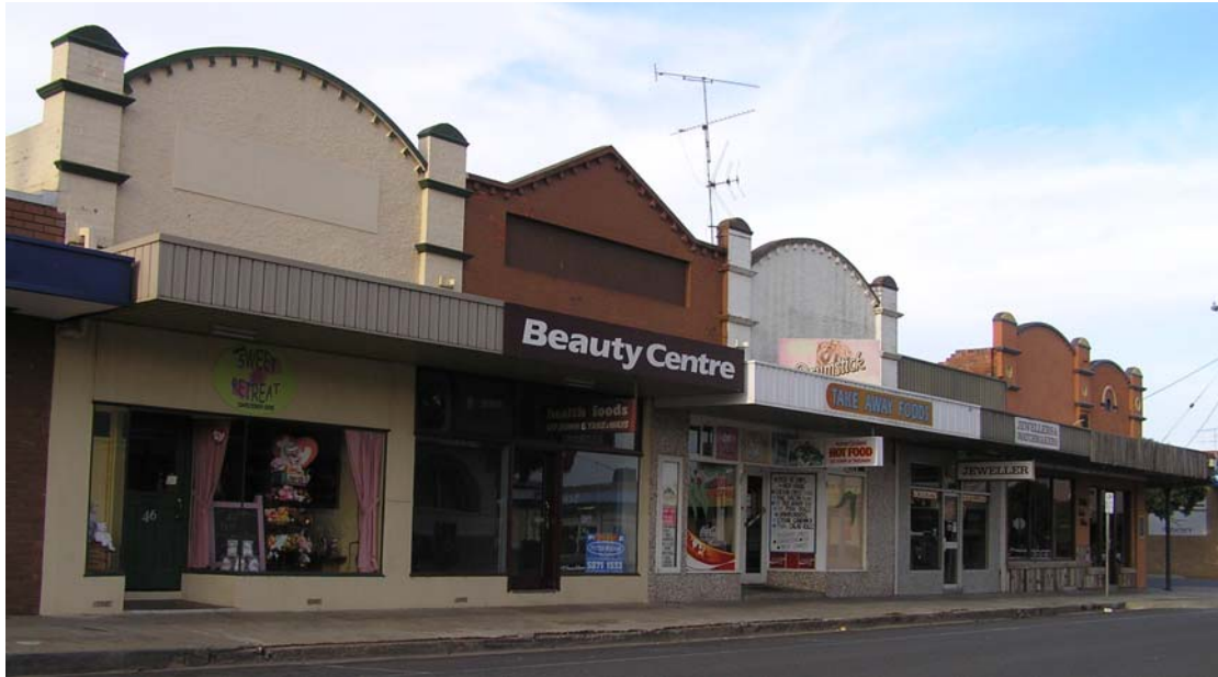
Fig. 50. Bank Street shops, north side.

All of the parapets of the Federation Free Style shops are intact except one, which could be reinstated to match the one on the nearest corner. However, the ground floor elevations appear to have been altered to various degrees. Leak Printing (far left in the photo above) may be the most intact. Removal of the blank board above the glass may reveal upper windows similar to those on the Beauty Centre adjacent. Furthermore, the posted verandahs have been replaced with cantilever verandahs. Reinstatement of the original design is possible using the available early photograph (see page 19).