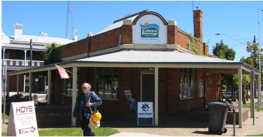
Fig. 16. Grain store (1909).

The old grain store, constructed 1909 by Harry H Farrall on the triangle between Main and Station streets is significant as a relic of the town's early grain storage system. Located between the train station and the Cobram Hotel, the site was ideal given the trade that ran between the two, with the Cobram Hotel advertising to purchase agricultural produce as well as selling goods to the district in the 1890s.