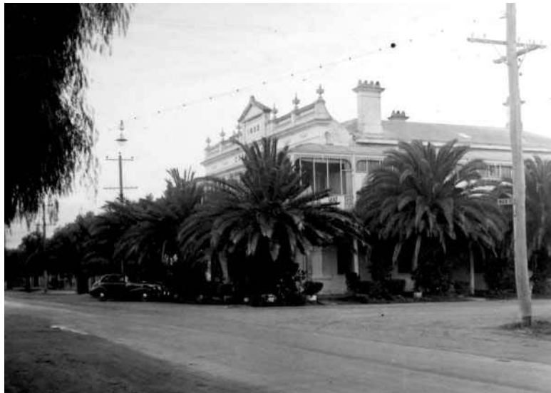
Fig 7. Cobram Hotel.