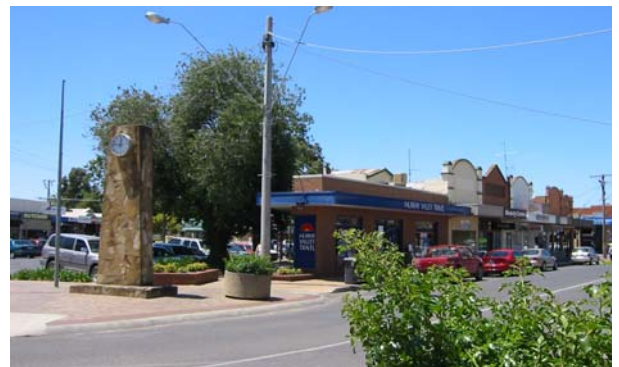
Fig. 26. Views NNE along Punt Road and East along Bank Street showing the triangular allotment with the clock at the apex.