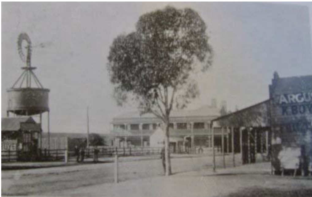
Fig. 3. View along Punt Road towards new Grand Central Hotel c.1902.

The precinct contains one of the earliest shops, formerly Brown Corke and Co (now the Masonic Centre) in Main Street, and many of Cobram's earliest shops along Punt Road and Bank Street. Flour milling was an important industry in the town, represented by the former 1909 grain store on the corner of Station and Main Streets. That area on the intersection on Main and Station has also been significant for other town activities such as transport, accommodation and banking and these are represented by the proximity of the station (1888) , Cobram Hotel (1892) and second Bank of Australasia (1947) . Further north along Punt Road, the precinct encompasses another important early hotel, the Grand Central (1902) . On the corner of Punt and Sydney streets were located an early concentration of stores of the early 1900s. Unfortunately few traces of these original stores remain, though the continuous