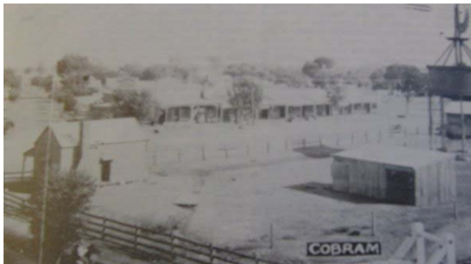
Fig. 22. Corner Sydney and Punt Road 1912 showing the old core of the town. Source: