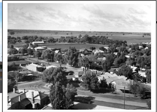
Fig Showing allotments with shops between Bank Street and Punt Road. Source: No. rw003793 SLV

The Cobram Post Office was, according to the Cobram Progress Association which suggested the addition of a memorial clock tower in 1909, the 'first in the Commonwealth to be built out of revenue'. 5 Prior to its construction in 1904 the postal service operated out of a 'little room' at the railway station, which was long deplored as 'utterly inefficient' by the Cobram Progress Association. 6 The building once also served as a postmaster's residence and it underwent a major renovation and enlargement in 1962. 7