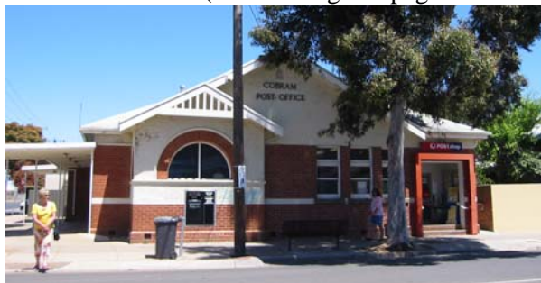
Fig 43. 1904 Post Office.

The 1904 post office building, is a domestic scale single storey brick structure, designed in the Federation Free Style, and it has a high degree of architectural integrity. Some changes have occurred including the loss of the picket fence, insertion of many post boxes, painting the previously unpainted cement render, and the application of the corporate image branding of Australia Post. (Refer to Figs on pages 13 and 19.)