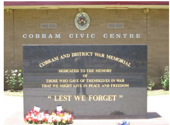
Fig 19. Cobram Civic Centre and War Memorial.

The Pioneers Park is significant as a site of recent civic beautification, which has several plaques that serve as a monument to 'pioneering days' in the Cobram area, with a reconstructed log cabin and memorial plaques, movable heritage and aesthetic features. In 1987 a local women's group erected a plaque to the pioneering women of the Cobram district.