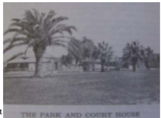
Fig. 20. View from the park towards the courthouse, probably c. 1960s, showing large palm trees.

Early views of Cobram show the use of trees, particularly palms and peppercorns, to beautify and shade the main thoroughfares of the town. In 1909 the Cobram Progress Association protested to the telephone department against the 'vandalisation of trees' in its erection of telephone cables, showing an early civic pride in the town's trees. Pictures from the 1920s also show rows of palm trees along Punt Road, and Station Street from which the large palm trees in these streets and Mivo Park are likely survivors. Another particularly mature tall tree is that located on the nature strip beside the Court House, on Punt Road across from the park.