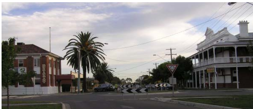
Fig 18. Intersection Station and Main St, showing view of 1947 bank, 1892 Cobram Hotel and palm trees

The 1942 wheat silos were managed by R. Eaton and controlled by the Grain Elevators Board.