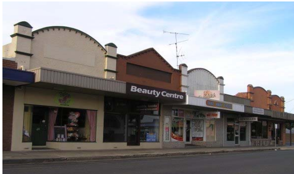
Fig 12&13. Bank Street shops.

The Bank Street shops are significant as they include notable examples of shops from the early 1900s-1920s. This was a period of marked growth both commercially and in terms of population for the town. (See also Significant Views)