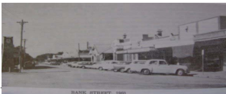
Fig 23. Bank Street, 1960, showing shop fronts, clock tower, bank and post office.