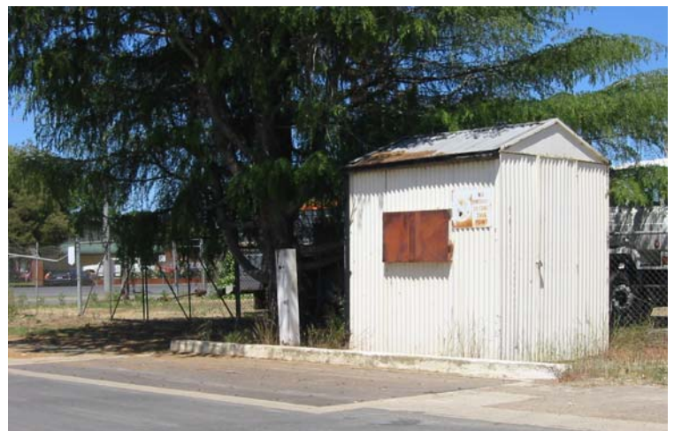
Figs 33-36 Rail track behind the silos. Weighbridge, scales and building. Silos Point lever for tracks. Railway Station.