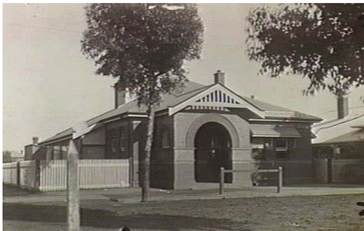
Fig 14. Cobram Post Office c.1917.

The Cobram Post Office was, according to the Cobram Progress Association which suggested the addition of a memorial clock tower in 1909, the 'first in the Commonwealth to be built out of revenue'. 5 Prior to its construction in 1904 the postal service operated out of a 'little room' at the railway station, which was long deplored as 'utterly inefficient' by the Cobram Progress Association. 6 The building once also served as a postmaster's residence and it underwent a major renovation and enlargement in 1962. 7