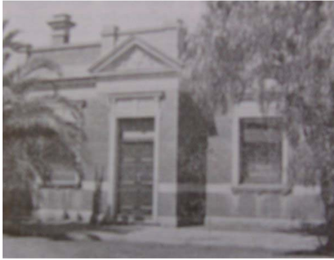
Fig. 15. The National Bank of Australasia on Bank Street in the 1940s, with trees outside.

but it was demolished after the bank moved, in 1909, to their new building, adjacent to the 1904 Post Office building in Bank Street.