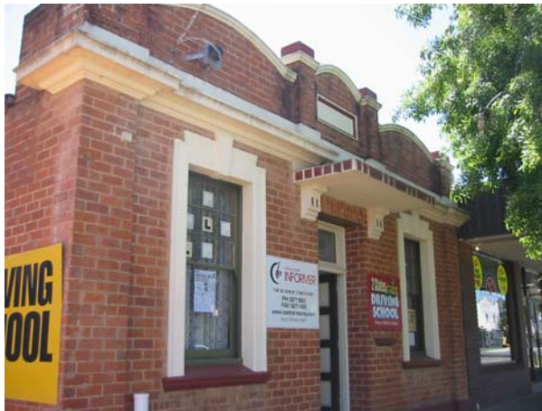
Fig 46. Station Street office.

The 1909 Federation Georgian Revival bank facade has been altered from the unpainted, un-rendered face brick (similar to the office in Fig. 47). However, the side elevation and tall chimney has retained the Federation period finishes and design, such as the square timber posts with simple timber brackets, unpainted red brick walls and timber verandah floor.