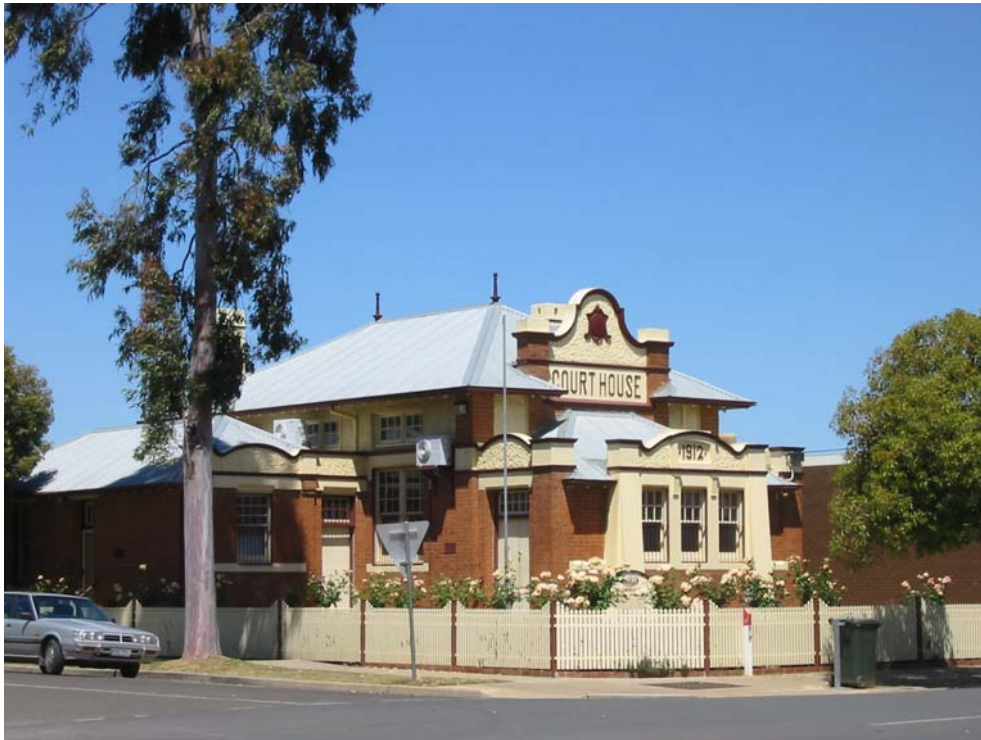
Fig. 49. 1912 Cobram Court House.

The 1912 Court House is a fine example of the Federation Anglo-Dutch style and the only building in this style of architecture in the precinct. It has excellent integrity and is still used for its original purpose. Noticeable alterations include the painting of the previously unpainted cement render and roughcast.