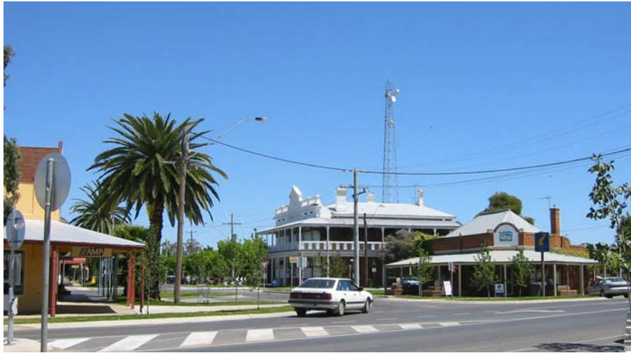
Fig. 1 View south from Punt Road to the old palm tree, 1892 Cobram Hotel and former 1909 Grain Store.