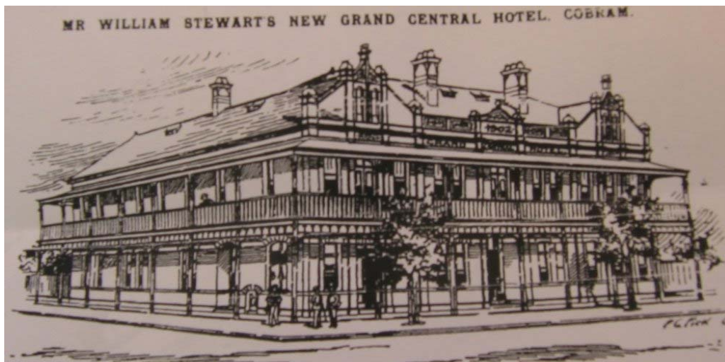
Fig. 9. Etching of Grand Central Hotel 1902.