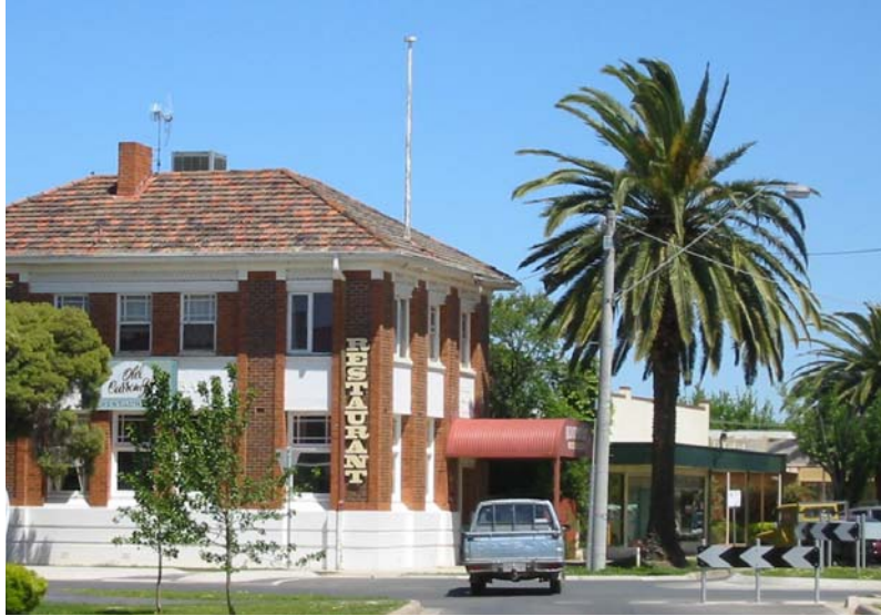
Fig. 52. former 1949 State Savings Bank.

emphasised by the thin contrasting band of bricks on the top of the plain rendered parapet and long cantilevered verandah.