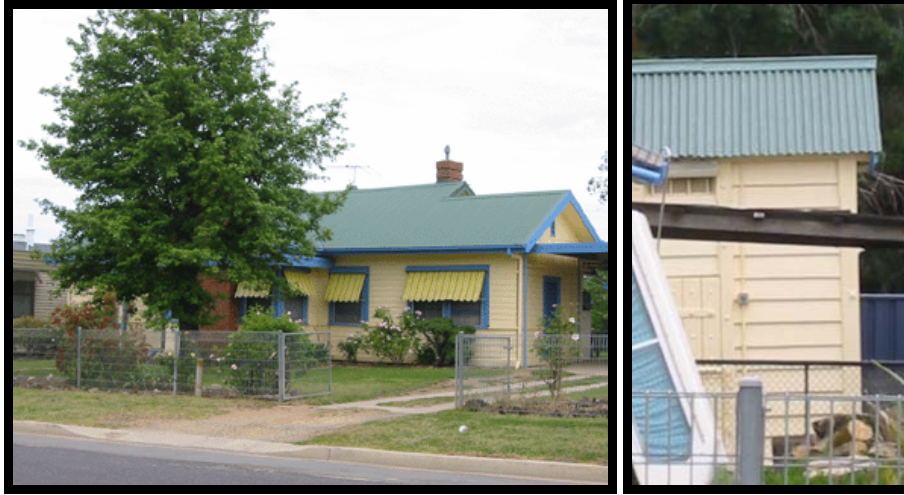
Figs 27, 28 House (former Police Station c1940 and Lock Up c1880), St James Main Road, St James