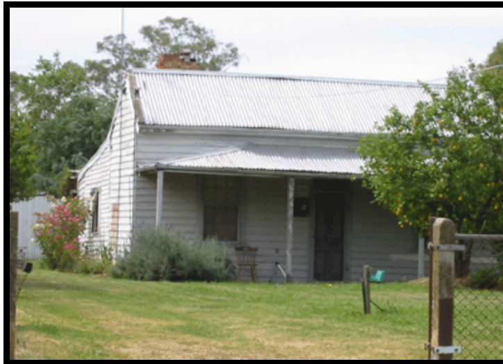
Fig 29 House, St James Road, St James

The old blacksmith that was on this site was closed by 1933 and the Police Station transferred to the site, with a new building, in the 1940s. 23 The site includes a portable timber lock-up at rear, which was transported from the Lake Rowan police site and dates from the nineteenth century.