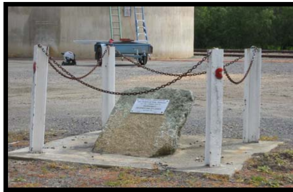
Fig 13 Centenary Railway Plaque in the railway reserve showing the proximity of the concrete silos and rail tracks in the picture. “This plaque commemorates 100 Years of rail service to the communities of Goorambat, Devenish and St James. 1883 – 1983”

Railway track and machinery associated with the importance of transporting goods to and from St James using the railway, has survived. The weighbridge platform, scales and building sit near the railway silos. The water and grain storage and transport infrastructure at St James mirrors that in adjacent towns across the shire, with a concrete water tower built in 1909, and wheat silos near the former railway yard site constructed in the immediate post war period. The weighbridge is an integral part of the operation of the transport of goods and hence its location next to the railway.