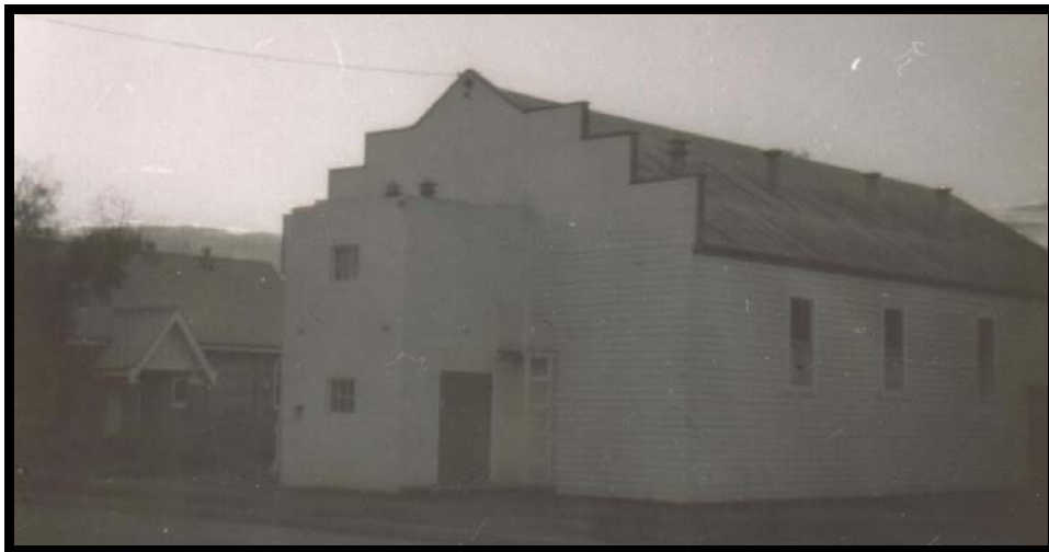
Figs 36, 37 Left: Hall, St James Road, St James Right: formerly Mechanics' Institute, n.d.