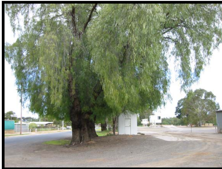
Fig 10 View showing visual relationship of J. F. Kelly Reserve and Bowling Green, Devenish Road, c 1880s Peppercorn trees, weighbridge building, weighbridge, rail tracks and platform