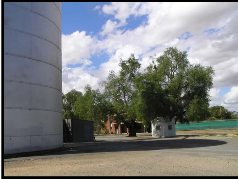
Fig 9 View showing the closeness of the railways with the town: Base of silos in foreground with weighbridge and peppercorns in middle ground and the hotel in the background.

They help to soften the view of hard, rigid surfaces such as concrete, asphalt roads, gravel driveways in the harshness of the full sun, by providing green colour, movement in the wind, change in appearance, change of heights, girths, variety in the details and shade for pedestrians as the day evolves.