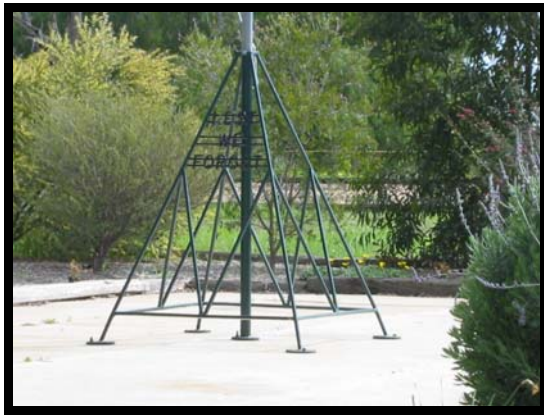
Figs 19, 20, 21. War Memorial, flagpole, and plaque.

Many people from the Shire were involved in both World Wars and experienced many losses from their communities. Places of enlistment during the Second World War included Bundalong, Cobram, Katamatite, Nathalia, Numurkah, Picola, St James, Strathmerton, Tungamah and Yarrawonga. Although many may have moved to Melbourne or other larger centres prior to enlistment, the Second World War Nominal Roll showed that 1,596 were residents in the Shire at the time of enlistment and 3,014 were born in the Shire. Honour Rolls for the First and Second World War were hung in many halls throughout the Shire and monuments, memorial windows, plaques and buildings were dedicated in memory of the fallen and those who served. 18