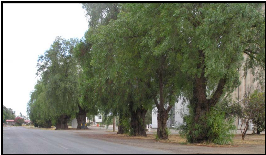
Fig 12 View showing the strikingly good visual impact of the large green flowing peppercorn trees along Devenish Road complementing the important but hard industrial surfaces adjacent.