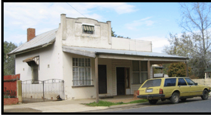
Fig 22. Shops, St James, Devenish Road

The concrete shop may have been built about the same time as the 1909 concrete water tower. Aspects of the shop design have Federation characteristics including the parapet and chimney. Certainly the pressed metal window hood on the side window is Federation in style, but it may have been added at another time.