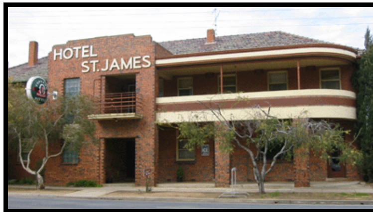
Fig 25 St James Hotel, Devenish Road