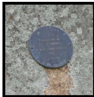
Figs 38, 39 St James' Primary School c 1915 building and Centenary Plaque.

“This plaque commemorates 100 years of Education at St James Primary School.”