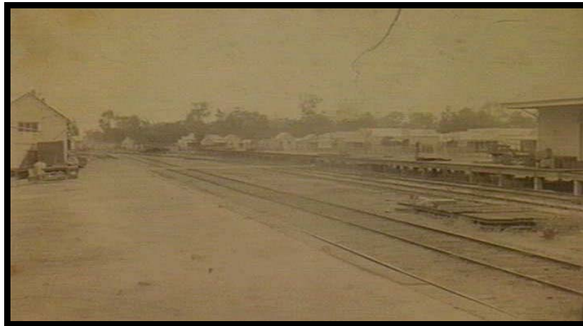
Fig 3. St James Station 1893 showing shops in the two main streets.

The township of St James was surveyed and established in conjunction with its adjacent towns, such as Tungamah and Lake Rowan, in 1875. The railway lines constructed in the Shire opened up transport to the south and in particular with Melbourne and the Melbourne to Sydney railway line. The population and development of the region had progressed rapidly from the land selections of the 1870s justifying the extension of existing railway lines from the south. In 1883 the Railway Department noted in the Argus: 14/09/1883 p. 10 – “Tender accepted for goods shed and platform at St James. Messrs. Hart & Fry, £1145.11.3.” Rail was the most rapid form of transport available at the time and the 1870s development was further enhanced in the 1880s and 1890s by the growth in business and employment opportunities generated by the opening of the railway lines.