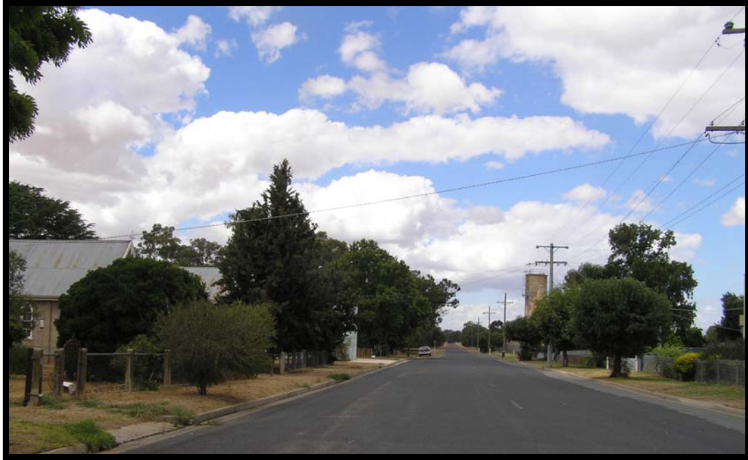
Fig 11 View towards the east, along St James Main Road, showing important foci: the church and trees on the left and water tower on the right.