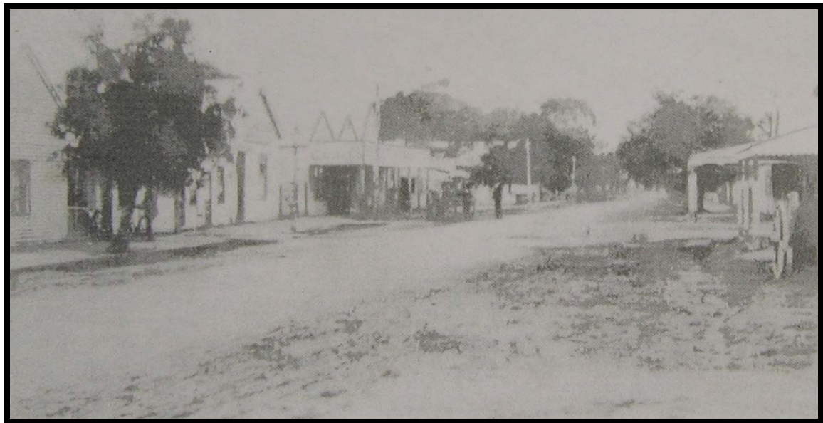
Fig 2. Shops (1882) Main Road, St James

To service the railway lines, townships such as St James, Katunga, Telford, Yarroweyah and Waaia were privately subdivided adjacent to planned railway stations. St James' first allotments were carved out of the land taken up by the Kelly family who arrived in the district in 1873. 3 The J F Kelly Reserve in Devenish Road, is named after this family. The township itself did not grow significantly until the 1880s, and it is to the early 1880s that the precinct's earliest surviving buildings can be dated. Other significant families who left their mark on the commercial landscape included but were not limited to the Dowlings and Carruthers who built early shops – a blacksmith and carpenters respectively. The small timber shops clustered on St James Main Rd are typical of the commercial aspect of the precinct in this period. The tornado of 1884 meant that 'hardly a building in the town remained intact' that was built earlier. 4