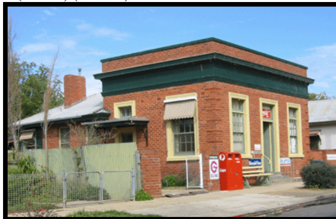
Fig 26 c1920s St James Post Office, Devenish Rd

The Post office has an intact Interwar Georgian Revival design in face red brickwork and (originally) unpainted cement render trims. The use of the classically based style has enabled the development of a building which exhibits the impression of strength and permanence.