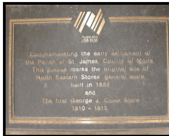
Fig 7 Bi Centenary Plaque: Source: Lorraine Huddle 2004

The extant brick shops, adjacent to the timber shops are formerly the National Bank. (fig ) While the site was that of the original 1890s building, the bank was demolished and remodelled in the post-war period, with the National Bank premises finally rebuilt in 1968. 13