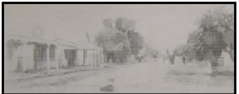
Fig 17 Left c 1880s-90s Avenue of 12 surviving Peppercorn Trees , St James DB 113