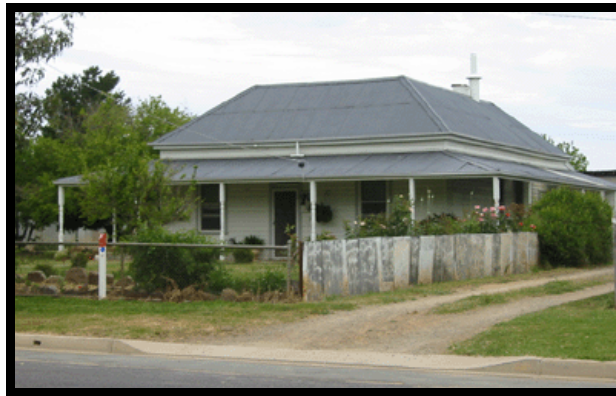
Fig 5 Coles 1895 House, St James Main Road, St James.