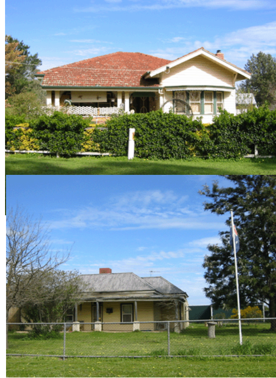
Figs 30, 31, 32,33 From left to right: Interwar Bungalows in Devenish Road (DB 262) and St James Main Rd (DB 95) Weatherboard house c.1939 (DB 258) and Victorian House (DB 96) in St James Main Rd.