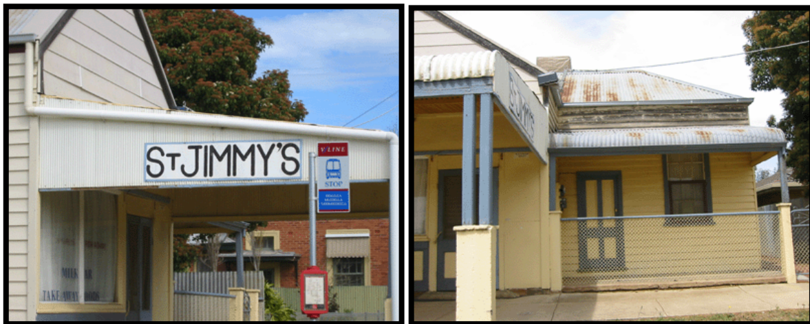
Figs 23, 24 St Jimmy's Shop and House, St James. Devenish Rd