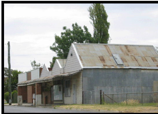
Fig 6 Shops (1882) Main Road, St James DB 260

The white Victorian weatherboard house on St James Main Rd (DB 266), adjacent to the police station, was built by George Coles Snr in 1895 shortly after he took on the North Eastern Stores. 9