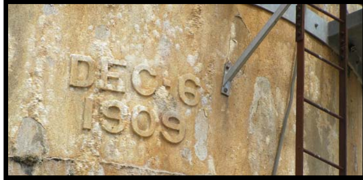
Fig 16. Concrete 1909 Water Tower, St James Main Road.

Concrete Water Tower (1909) designed by John Monash. St James Main Rd