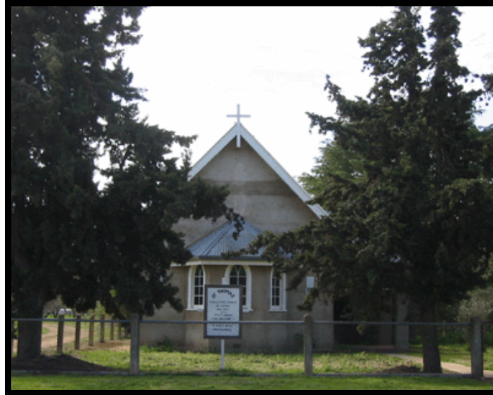
Figs 34, 35. 1923 St Thomas Anglican Church, trees and fence, St James Main Rd, St James

The Church of England established churches at Almonds, Barmah, Boweya North, Cobram, Katamatite, Katunga, Nathalia, Numurkah, Picola, St James, Strathmerton, Tungamah, Waaia, and Yarrawonga.