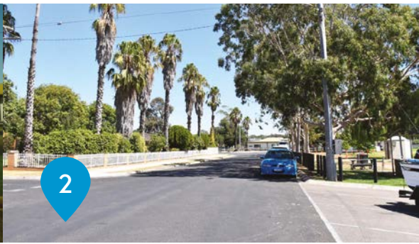
There is a great opportunity to convert the section of Hunt St between Belmore and Hume St into park.