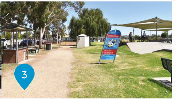
The current pathway is cluttered.