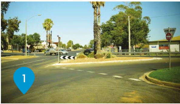
Access to the Foreshore and VIC is convoluted and uninviting.