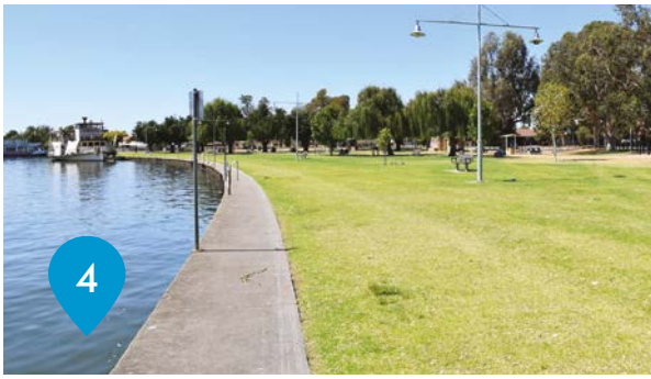
The path at the lake's edge is narrow and offers little opportunity for engagement with the water.