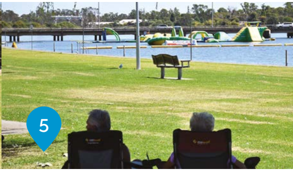
We noticed people bringing their own chairs under the trees, of which there are few.