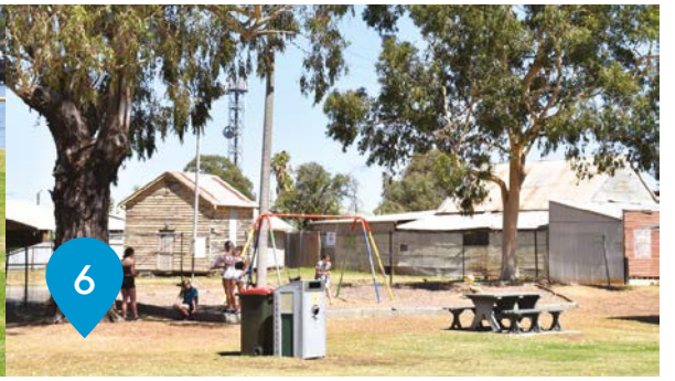
Play equipment is outdated and offers little imaginative and nature-based play opportunities.